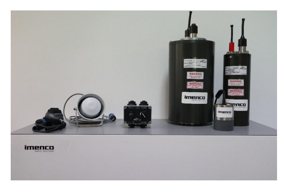
Model 3140 Bell System