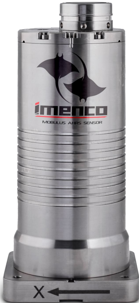
Imenco Attitude & Heading Reference Sensor