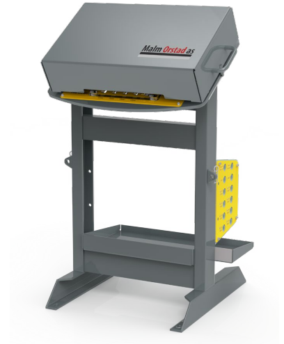
MO111212 With protection cover