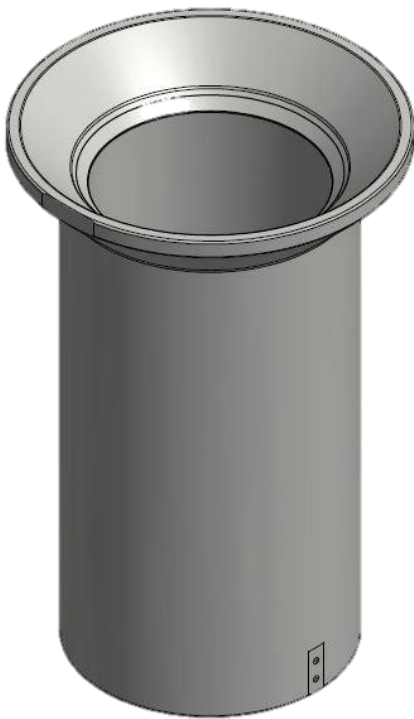
Receptacle for Top- and Anchor- releasable guidepost